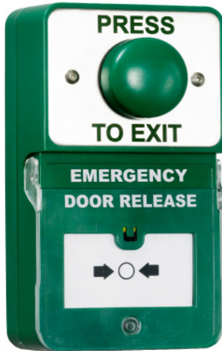
Dual Unit - Button & EDR