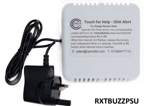
RXTBUZZPSU Time adjustable Buzzer Plug in PSU Double sided fixing Pad

Through glass option will not work on low e treated glass