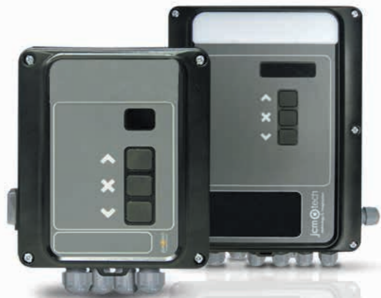
CONTROL PANELS VERSUS