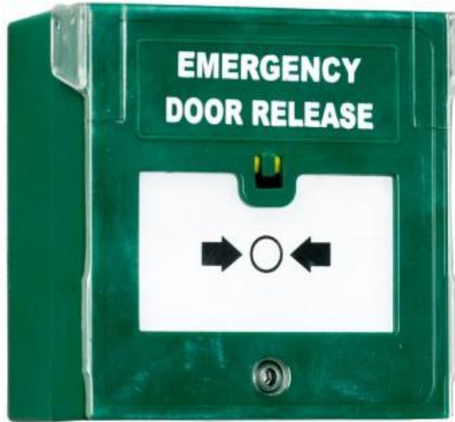
Emergency Door Release