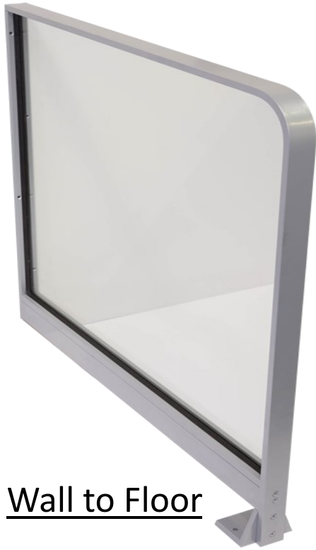
Wall to Floor